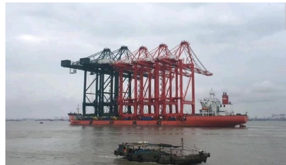
Container cranes on ship, ready for transport.

With a setup time of less than one hour, the unit is ideal for normal and fast response projects.