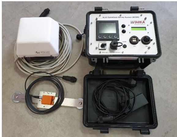
MOSS unit (right-top) with motion sensor (left-bottom) and IRIIDIUM unit (left-top)

The MOSS is a practical, robust and portable measurement solution with many options to log and monitor different kind of inputs. The system can be applied in harsh environments without any special installation requirements.